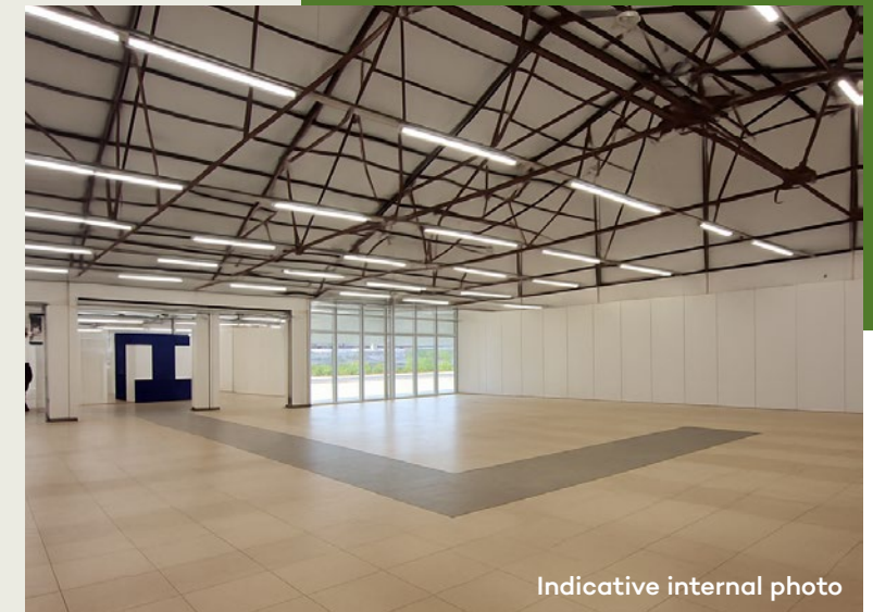
Indicative internal photo