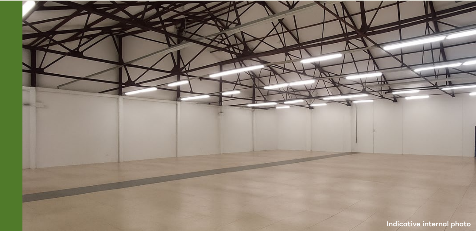
Indicative internal photo