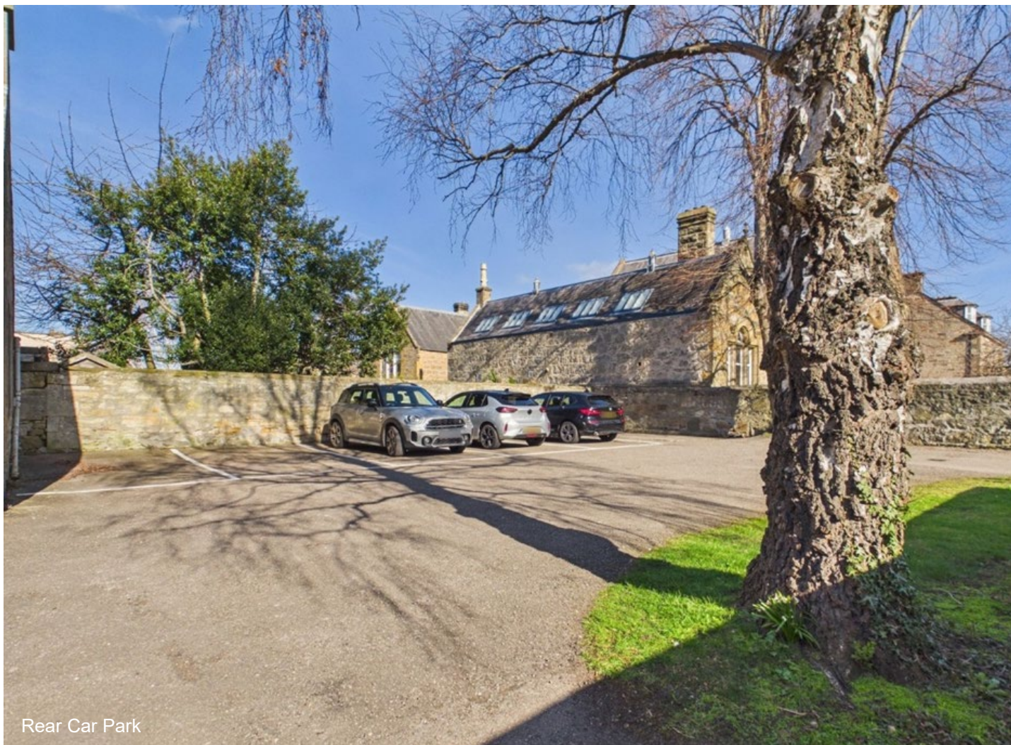
Rear Car Park

J & E Shepherd for themselves and for the vendors or lessors of this property whose agents they are, give notice that: (i) the particulars and plan are set out as a general outline for the guidance of intending purchasers or lessees, and do not constitute, nor constitute part of, an offer or contract (ii) all descriptions, dimensions, references to condition and necessary permissions for use and occupation, and other details are given in good faith and are believed to be correct at the date of first issue but any intending purchasers or tenants should not rely on them as statements or representations of fact but must satisfy themselves by inspection or otherwise as to the correctness of each of them; (iii) no person in the employment of J & E Shepherd has any authority to make or give any representation or warranty whatever in relation to this property; (iv) all prices and rentals are quoted exclusive of VAT unless otherwise stated. Prospective purchasers/lessees must satisfy themselves independently as to the incidence of VAT in respect of any transaction. PUBLICATION DATE: March 2026