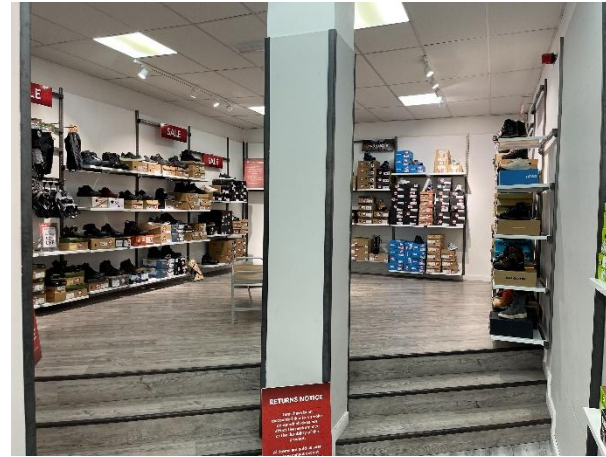
Ground Floor Sales