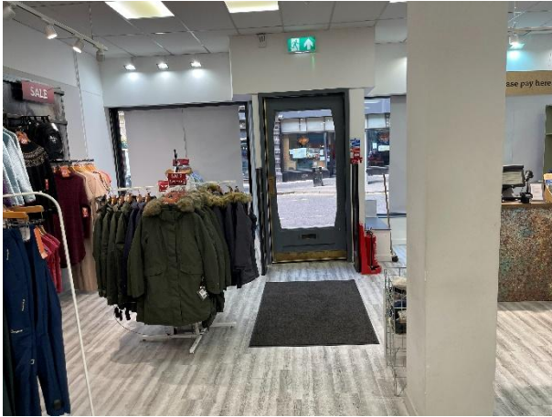
Ground Floor Sales